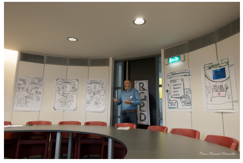
During the responsible day at Croix Rouge de Belgique, a workshop related on Global Data Protection Regulation) based on visual presentation